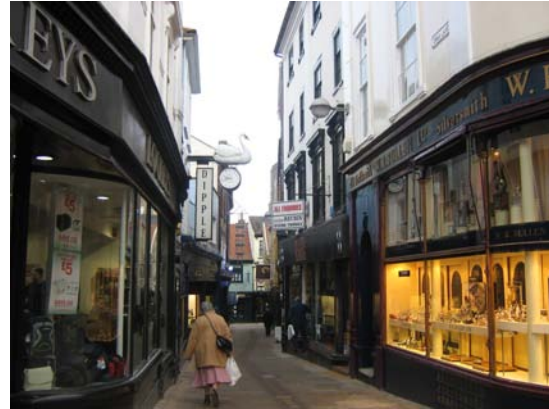
'Norwich Lanes' – Swan Lane