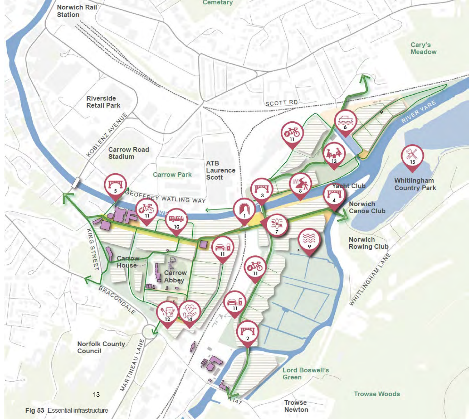
Fig 53 Essential infrastructure