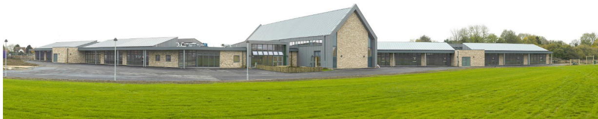
ROSECROFT PRIMARY SCHOOL (new school for Attleborough)

Sustainable Urban Extension of 4,000 new homes.